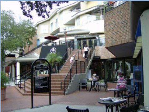
Near Shopping & Dining