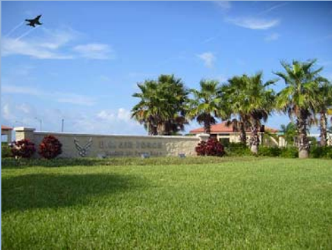
Close to MacDill Air Force Base