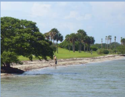
Local Beaches & Dog Beach